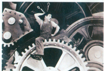
MODERN TIMES, 1936